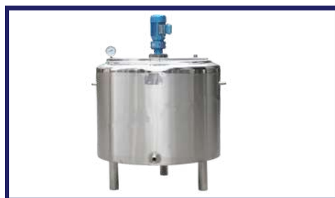
TANK WITH AGITATOR