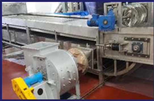
MESH BELT COOLER