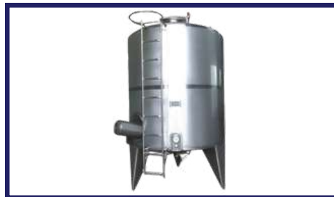
VERTICAL STORAGE TANKS