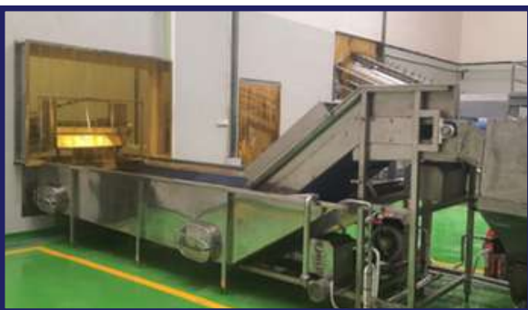
COCONUT BUBBLE WASHER