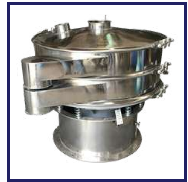
VIBROSCREEN GRADING MACHINE