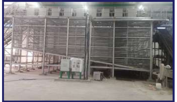
NUTS STORAGE BIN