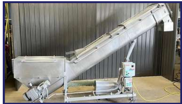
SCREW CONVEYOR WITH WASHING ARRANGEMENT