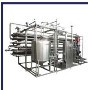
ASEPTIC WATER PLANT