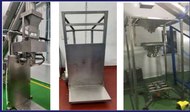
AUTOMATIC BATCH WEIGHER