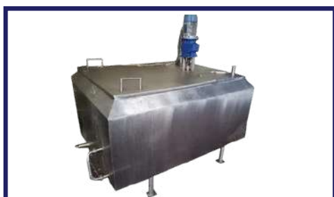
HORIZONTAL MILK STORAGE TANK