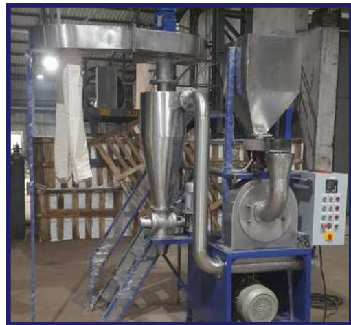
COCONUT FLOUR GRINDING MACHINE