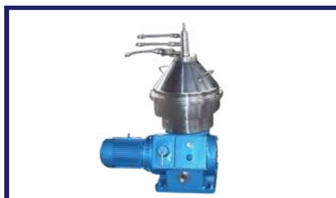
CENTRIFUGE FOR CREAM