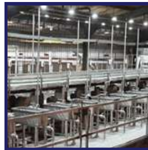
COCONUT DRILLING UNIT