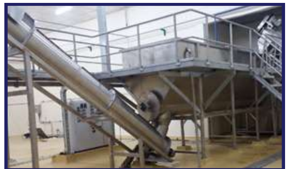
STORAGE TANK (MEAT TANK)