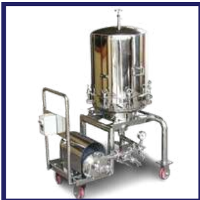
SPARKLER FILTER (POLISH FILTER)