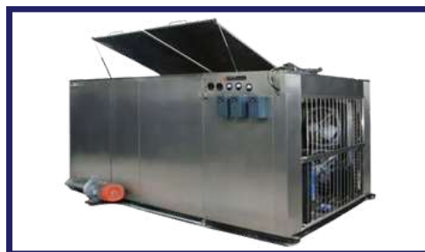
ICE BANK TANK (IBT)