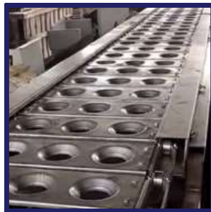
COCONUT WATER EXTRACTION CONVEYOR