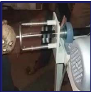
COCONUT WATER DRILLING MACHINE