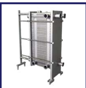
CHILLING PHE FOR COCONUT WATER