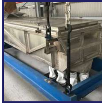
NOVATEX (HIGH CAPACITY) SORTING MACHINE