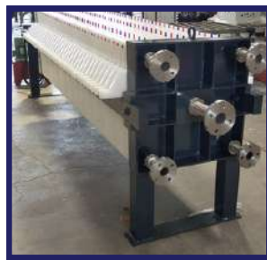
FILTER PRESS WITH FOOD GRADE PP PLATES