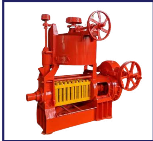
PARING OIL EXPELLER