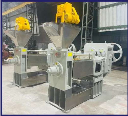
VCO OIL EXPELLER HIGH CAPACITY