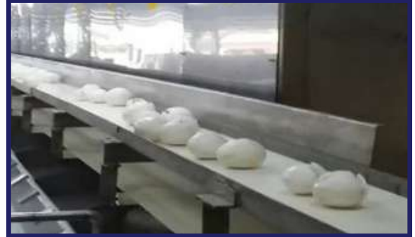
KERNEL CARRYING CONVEYOR