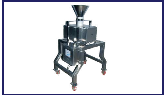
GRAVITY FEED METAL DETECTION SYSTEM FOR DRY POWDER