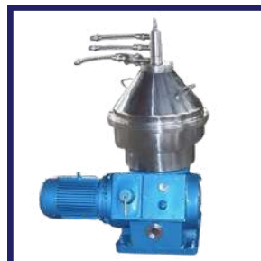
CENTRIFUGE FOR VIRGIN COCONUT OIL